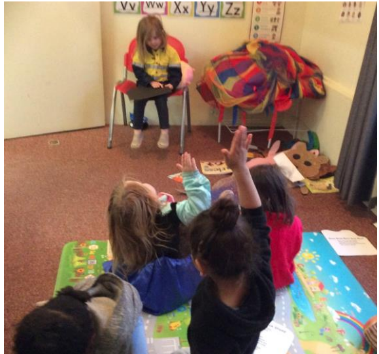
LIL'ANTZ TRAIL EDITION 2 2022