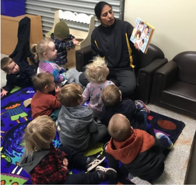
ANYTIME ANYWHERE CHILDCARE